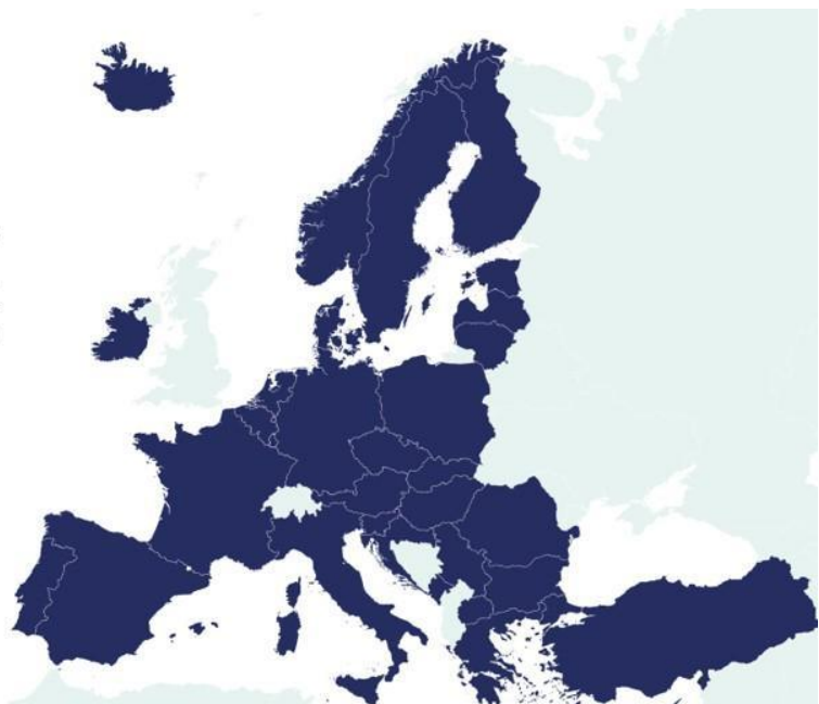
FIGURE 1: THE EUROHPC JOINT UNDERTAKING IS COMPOSED OF PUBLIC AND PRIVATE MEMBERS